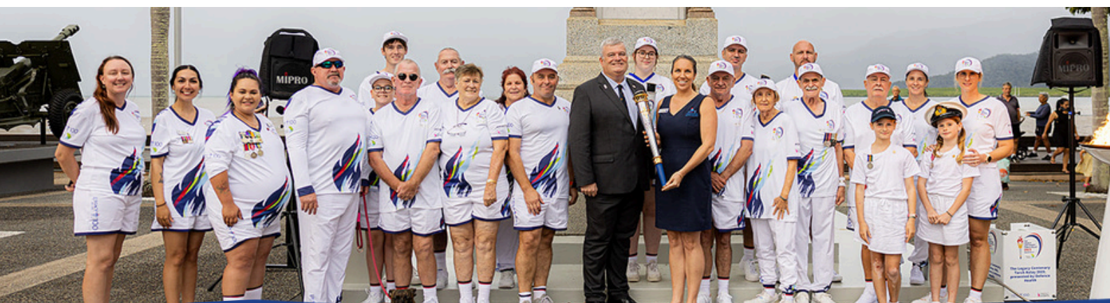
Far North Queensland Legatees and Beneficiaries